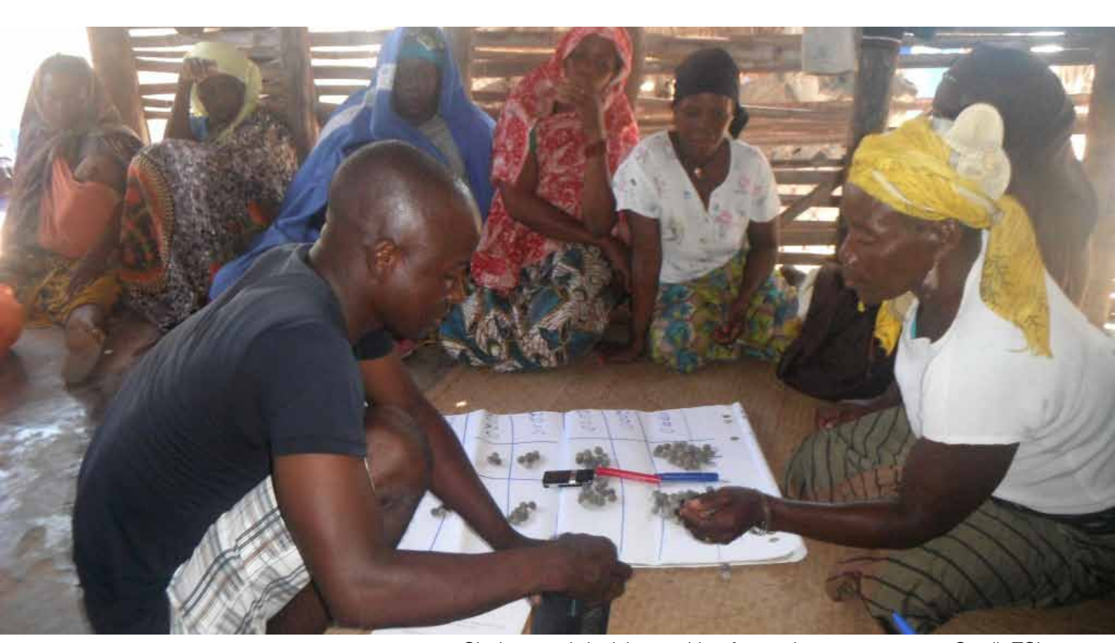
Choices and decision-making for marine management

The use of participatory approaches in logframe development represents an investment of both time and money. Initially this may seem to be a hindrance to Darwin applicants, however this investment invariably pays off. During project start up, for example, the team will be well versed in the project's objectives and activities, and will be capable of beginning implementation immediately.