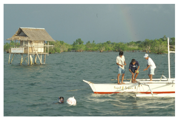
Marine Protected Area (MPA) in Bohol, Philippines

My Darwin Initiative grant, for Conservation biology of seahorses and pipefishes (1994-1996), has made a global conservation impact. Darwin funding allowed me to launch conservation field-work with colleagues in Vietnam and the Philippines. In collaboration with communities, we looked at the biology of seahorses and pipefishes, the ecological and socioeconomic importance of their exploitation, and our management and conservation options. We also developed the guiding vision for the Project Seahorse team that emerged from this Darwin project: a world in which marine ecosystems are healthy and well-managed.