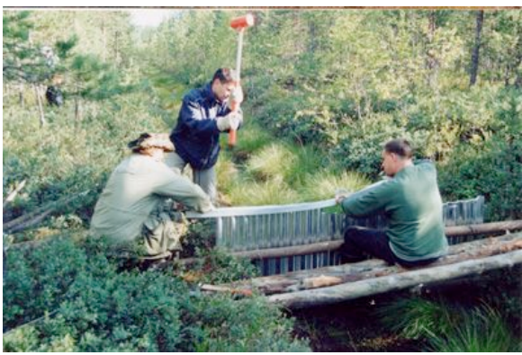
Repairing drainage in a Russian peatland during a PBP follow-up project.

In target countries anticipating 2004 accession to the European Union, PBP trainees were also ready to grasp opportunities presented by the EU-LIFE funding programme, for example to restore the Häädemeeste wetland complex in Estonia (2001) and to implement the mire habitat management plan for Latvia (2004). Indeed, the wheel has now turned almost full-circle. This summer, three PBP alumni will bring 25 personnel engaged on a EU project aiming to conserve Baltic raised bogs in Poland to see the latest results of similar work in Scotland. This time, they will pay the bills!