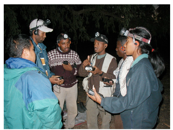
Bat detector training for Malagasy students

under supervised study and are expected to complete their training in 2007/08