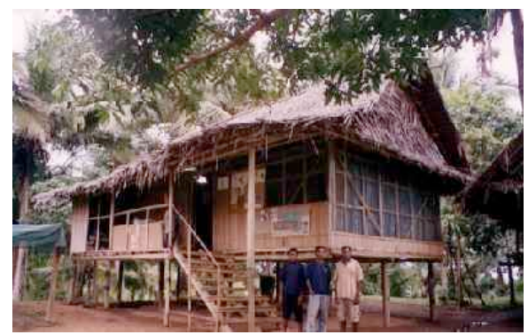
'Bush laboratory' in Ohu village, constructed as a base for biodiversity surveys in pristine rainforest

PAPUA New Guinea (PNG) contains 5-8% of the world's biodiversity, including at least 20,000 species of plants (70% of them endemic) and a large, but unknown number of insect species. It has been designated as one of the world's three major tropical wilderness areas, but it is extremely inaccessible and enormous tracts of forest remain virtually unexplored by biologists. Although 70% of the original forests of PNG are still intact, they are coming under increasing pressure due to population increase, the increasing aspirations of the people towards material development, and increasing demand for timber as exploitable forests in neighbouring Malaysia and Indonesia diminish. Identifying which parts of the existing forests in PNG are most valuable is currently the top conservation priority, at a time when the government is considering granting major logging concessions. However, in 1993 the PNG Conservation Needs Assessment report identified poor knowledge of the country's biota as a major obstacle to designing conservation strategies