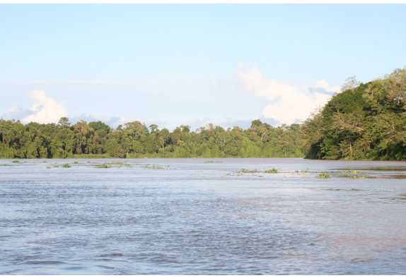
The Kinabatangan river and its riparian and degraded forests, home of one of the largest orang-utan populations of Sabah, about 1,100 individuals. The study carried out during the project took place in the Lower Kinabatangan floodplain, recently gazetted as a Wildlife Sanctuary in August 2005.

Due to their unique diversity and abundance of wildlife, the remaining forested areas in this region were recently gazetted with a view to creating a corridor for wildlife along the floodplain of the Kinabatangan River. However, these forests are seriously fragmented and it was not known whether this habitat fragmentation and its resultant isolation of orang-utan sub-populations would impact the long-term survival of the orang-utan in this area. The results of the genetic study were astonishing: for the first time a recent and alarming decline of a great ape population – brought about by man – was demonstrated, dated and quantified using genetic information. The results were immediately made available to decision makers in position to make management changes that will improve the viability of the remaining orang-utan populations in the project area and in Sabah.