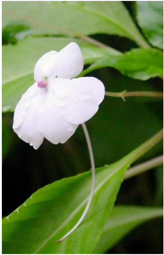
Ray of Hope sold at Eden to raise money for plant conservation

http://www.geobot.ethz.ch/publications/books/kapisen