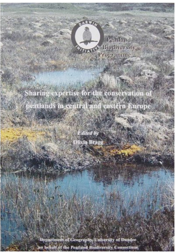
A full account of the Peatland Biodiversity Programme can be found in the book Sharing Expertise for the Conservation of Peatlands in Central and Eastern Europe , available at <a href="http://www.imcg.net/">http://www.imcg.net/</a> (Publications).

The Darwin Initiative Peatland Biodiversity Programme was co-ordinated by the University of Dundee Geography Department on behalf of the Peatland Biodiversity Consortium, which comprised six academic, government and non-government organisations with key roles in Scottish peatland conservation. The consortium organisations were Scottish Natural Heritage, the Scottish Wildlife Trust, the universities of Aberdeen, Dundee and Stirling and the Macaulay Land Use Research Institute.