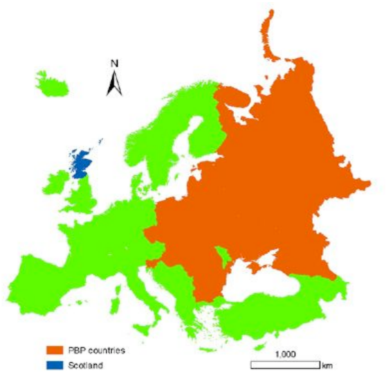
Map of Europe showing Scotland and the area covered by the PBP target countries Belarus, Bulgaria, Czech Republic, Estonia, Hungary, Latvia, Lithuania, Poland, Romania, Russia, Slovakia, Slovenia and Ukraine

For example, the extent of peatlands in Slovakia was unknown five years ago; there is now a national peatland inventory, peatland education in schools and a developing peatland management programme backed by ecohydrological research, achieved through a series of three internationally funded projects instigated and led by PBP trainees.