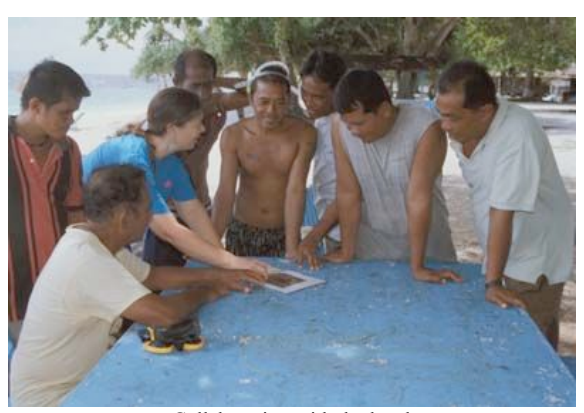
Collaborating with the local fishing community in the Philippines

Project Seahorse is an interdisciplinary and international organisation committed to conservation and sustainable use of the world's coastal marine ecosystems. We number about 35 professionals working around the world, and linking research and management at scales ranging from community initiatives to international accords. Collaborating with stakeholders and partners, we use seahorses to focus our efforts in finding marine conservation solutions.