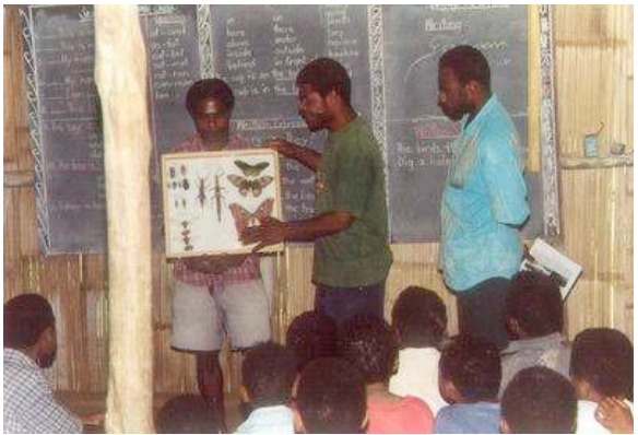
Parataxonomists talking to local school children about rainforest insects and environmental issues

common practice for surveying hyper-diverse biological communities throughout the tropics.