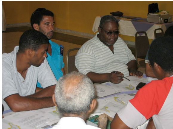
Stakeholders (artisanal fishermen) making decision on marine zoning in Seaflower Biosphere Reserve

http://www2.unesco.org/mab/br/brdir/directory/biores.asp?mode=a ll&code=COL+05