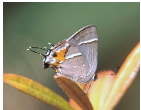
Drury's Hairstreak Strymon acis leucosticha, a subspecies endemic to TCI