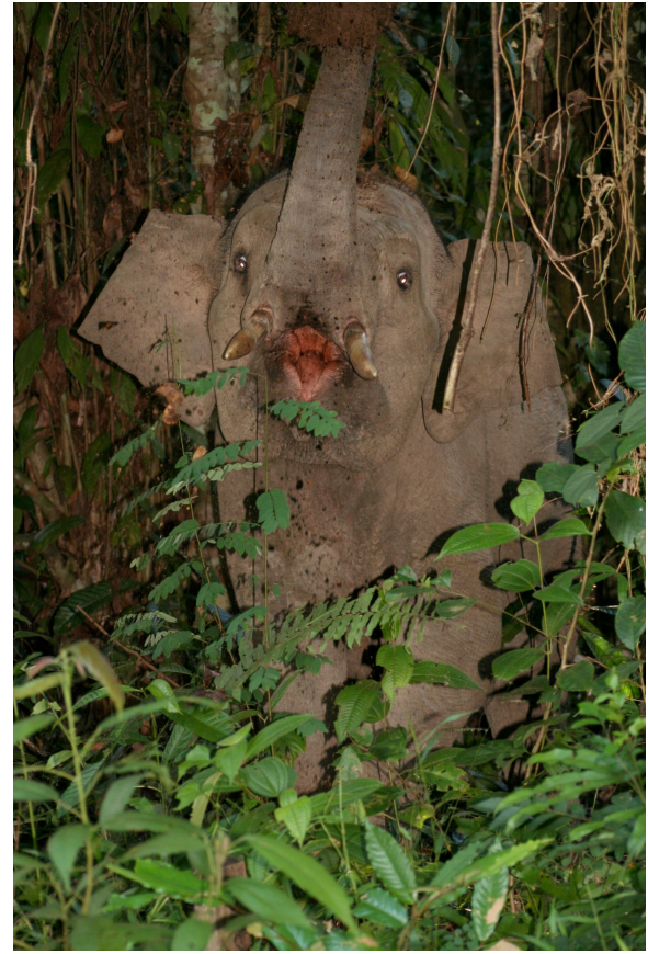
A young Bornean elephant male in the forest of the Lower Kinabatangan Wildlife Sanctuary. The new DI project (14-014) currently carried out by Cardiff University and its partners in Sabah will help setting up conservation measures for the Bornean elephant populations in Sabah.

The groundbreaking findings of our research were published in top ranking international biology journals such as PLoS Biology (2 papers), Molecular Ecology (2 papers) and Animal Conservation (1 paper) and have attracted widespread media coverage including local press in Sabah (Daily Express, New Sabah Times, etc) and Malaysia (New Straits Times, The Star, etc), British press (The Times, The Guardian, BBC, etc), world press (Washington Post, National Geographic, The Hindu, Le Monde, Libération, etc) and the internet (more than 60 web pages). Finally, the project led to another initiative (DI 14-014) currently focusing on the conservation of the Bornean elephant in Sabah.