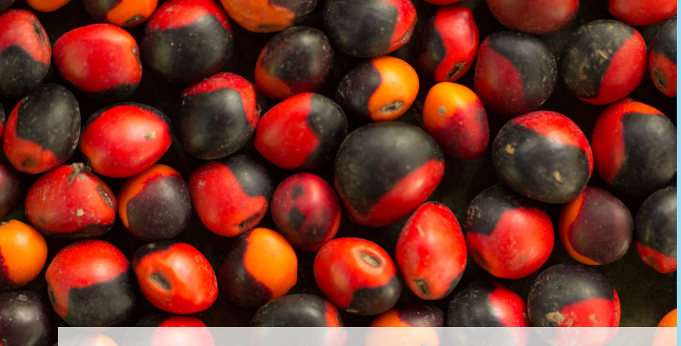
Huayruro seeds.

In addition to being a valuable long-term 'insurance policy' against extinction, seed banks can support other conservation activities such as propagation of threatened species, habitat restoration, reintroductions, and landscaping with native species. It is expected that enabling seed to be banked in-country will provide a readily available source of material for such conservation work as well as encouraging the use of native species in plant nurseries, in addition to its core role as a long-term genebank for species of high conservation value. Meanwhile, at Kew, seeds banked at the MSB are yielding data on viability and dormancy, as well as the resulting live material used for developing horticultural protocols (http://www.kew.org/science-researchdata/directory/projects/ExSituConsCollsUKOTs. htm) and undertaking research into species genetics and their position on the tree of life.