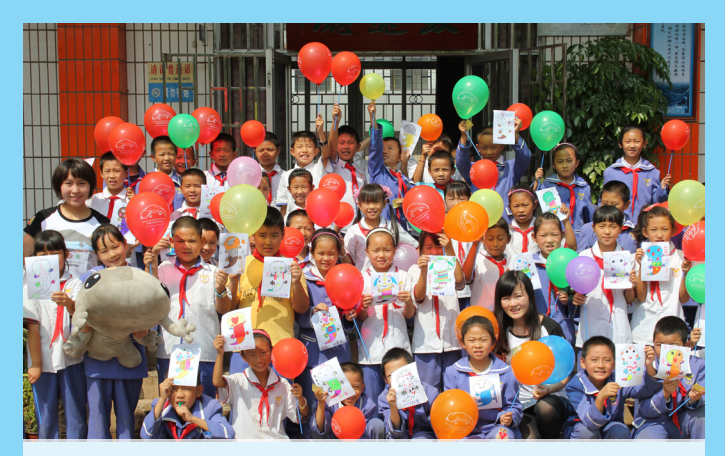
Group photo of a school CEPA campaign in Lufeng county, Yunnan Province (September 2013). The students are showing their Chinese giant salamander drawings.

Communication, Education and Public Awareness-raising (CEPA) is also a strong aspect of this Darwin project and public campaigns and educational outreach have been initiated by the project team in China to raise the conservation profile of the Chinese giant salamander. Earlier this year, public questionnaire surveys were conducted in Yunnan, Shaanxi and Guizhou provinces to collect the first baseline data of public awareness towards the salamander and to find out determinants of people's knowledge and conservation perceptions. Further to these,