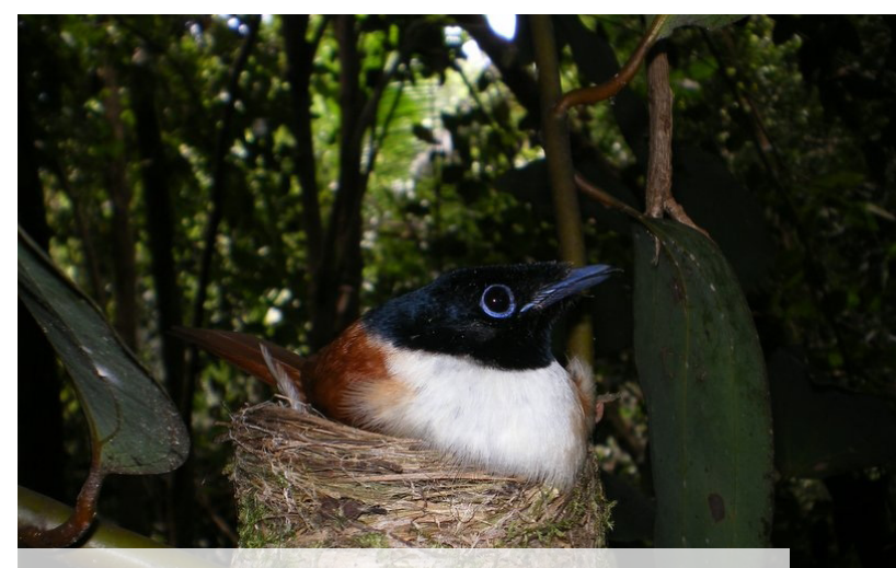
A flycatcher on its nest. Seychelles.

The Darwin Initiative project was led by the