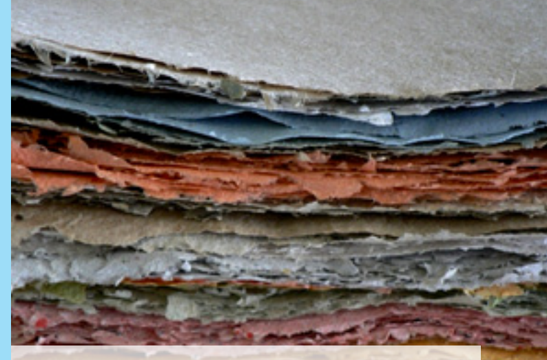
A selection of handmade paper.

In 2011 SHAPE secured funding from OTEP for a project to establish the first paper and card recycling facility on the Island. The aim was to increase production capacity of our paper fuel bricks and hand-made paper through the purchase of mechanised equipment, increase work space and integrating additional disabled people into the workplace. Our objectives were achieved and SHAPE now has a dedicated paper and card recycling centre.