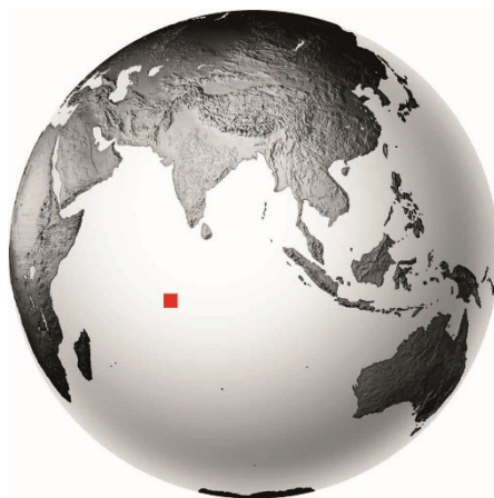
Figure 1: The red square denotes where the Chagos Archipelago is situated within the Indian Ocean.

The restoration of seabird islands in this remote and undisturbed sanctuary in the central Indian Ocean has multiple cross-ecosystem benefits. On land, in the absence of invasive rats, biodiversity will increase, especially the globally declining family of seabirds. This increase will restore the cross-ecosystem benefits bestowed by seabird islands and will in-time benefit threatened habitats such as the surrounding coral reefs. Reaching further, the healthy terrestrial and marine ecosystems supported by seabird islands within the Chagos Marine Protected Area can provide a source of recruits to the anthropically pauperised ecosystems that surround the archipelago to the east, north and west.