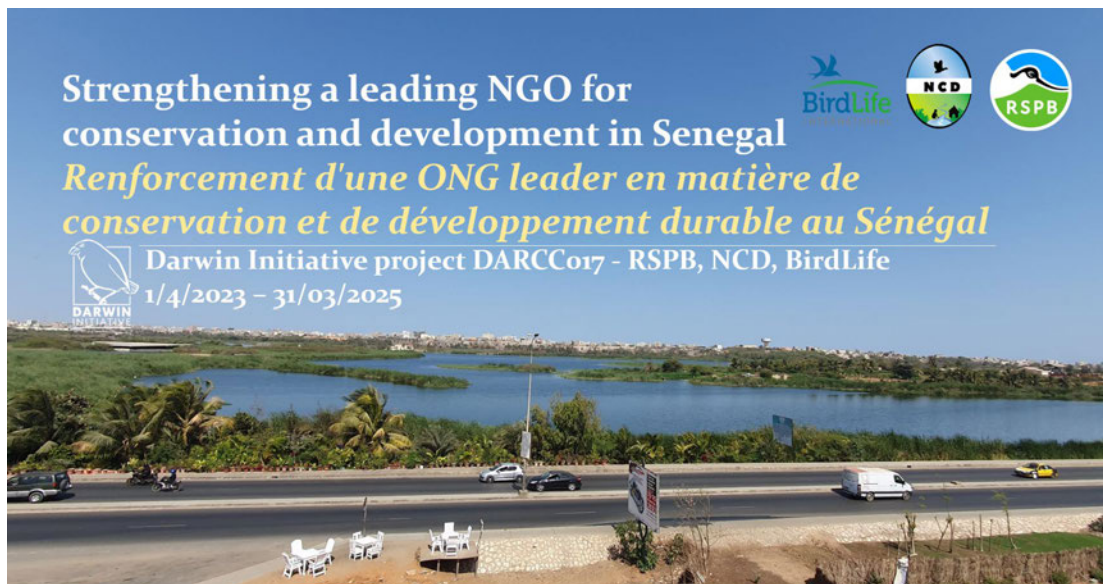
IMAGE 1: Opening slide of the Online Launch Ceremony for the Project

According to FCDO Travel Advice, political demonstrations are likely to increase in the run up to presidential elections in late February 2024. These demonstrations usually take place in Dakar and other major cities; and occasionally they can turn violent. We will continue to monitor how the situation evolves. However this will make early booking to save money on flights for RSPB staff to travel to Senegal in Q4 challenging.