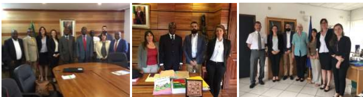
Figure 4. Meetings with the: fisheries department of Ministère de l'Agriculture, de l'Élevage et de la Pêche (MAEP) in Brazzaville (left panel); Monsieur Henri Djombo Minister of State l'Agriculture, de l'Élevage et de la Pêche (center panel), and EU delegation Saskia De Lang, Tom Ashwanden and Camille Pubill (right panel).

A key activity in FY2 has been maintaining regular correspondence, meetings and engagement with stakeholders from the Ministère de l'économie forestière et du développement durable et de l'Environnement ( MEFDDE ) and the Ministère de l'Agriculture, de l'Élevage et de la Pêche ( MAEP ). This has resulted in requests to support government activities, provide technical support and input on vessel monitoring systems, and disseminating outputs of enforcement patrols at the highest levels of government. Most notably this has included a presentation on IUU fishing (using data gathered as part of the project) with: (1) key representatives of MAEP in Brazzaville; (2) Monsieur Henri Djombo ( Minister of State for Agriculture, Animal Husbandry and Fishing) a leading figure within government; and (3) EU Ambassador Saskia De Lang, Tom Ashwanden (Head of Cooperation) and Camille Pubill (Project Manager Rural Development) to help increase awareness of IUU fishing in Congo within Government and its impacts on food security and local livelihoods ( Figure 4 ). Engagement with the EU resulted in a request to produce a summary report that detailed current status and potential opportunities to improve fisheries governance in Congo; which is to be discussed at a forthcoming meeting with member states about possible EU support.