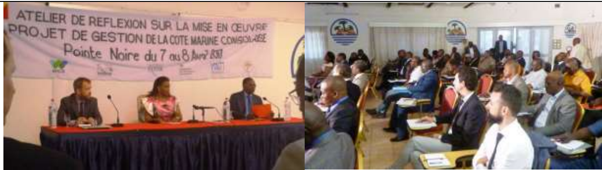
Figure 1. Congo Marine stakeholder workshop. Pointe Noire, Republic of Congo (April 2017).