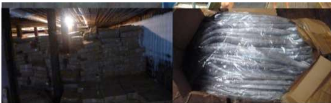
Figure 2. IUU fishing vessel involved in transshipping (as indicated by undeclared, packaged fish products in the hold) apprehended 25 th July 2017.

neighbouring Gabon; and (4) increasing engagement with the marine marchande (who are responsible for regulation of vessel navigation and maritime transport).