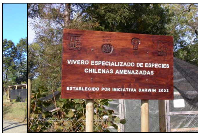
General view of the fenced area.