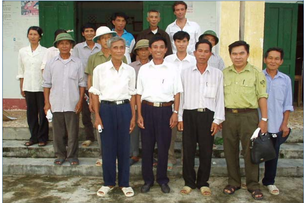
Residents of Minh Chau commune at the meeting

The meeting began with short presentations by members of the Park management on overall Park activities, and the current situation regarding Park protection and conservation. Frontier-Vietnam then provided an update of both BTLBBAP and VNF projects and their respective activities. Participants from the buffer-zone communes then provided input and opinions on various issues.