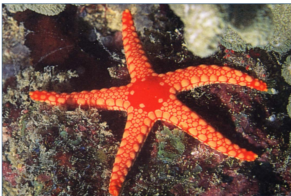
A starfish species of Bai Tu Long bay

Recent statistics (certainly insufficient) reveal that coastal fauna and flora of Vietnam comprise about 11,000 species: 537 phytoplankton species, 657 zooplankton, 6,377 large seabed species (e.g. 2,500 mollusc species), 1,500 shellfish species...), 2,038 fish species (particularly 455 coral reef species), 21 reptile species, 12 mammal species (whale), many species of birds including more than 200 winter-migrating bird species to Vietnam. These figures above show the importance of Vietnam's coastal biodiversity, a very significant genetic resource.