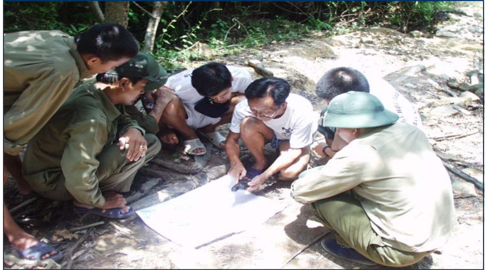
Staff from the Institute of Ecological and biological Resources and the National park working in the field

A study of the forest flora provides the basis of the ecological work. Vegetation plots are situated in areas of forest characteristic of the ecosystems of Bai Tu