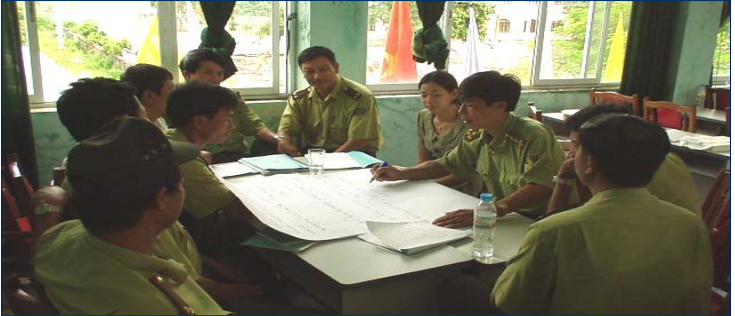
Forest protection staff discussing activity plans

Since the official opening more than 6 months ago, Bai Tu Long National Park has expanded its main activities in the area. In 2002, the Park management and staff have determined that the most important responsibility is to undertake effective management, prevent damage and disturbance affecting the natural landscape and resources of the Park and then gradually expand investment and development projects in the Park. To fulfill those important duties, the management has defined the Park boundary both in the field and on maps, and set up the landmarks of the Park with the standard signposts stipulated by the Ministry of Agriculture and Rural Development. Up to now the signposts have been basically completed and brought into play for their positiveness for protection. Besides that, the Park management has also enhanced the importance of community educa-