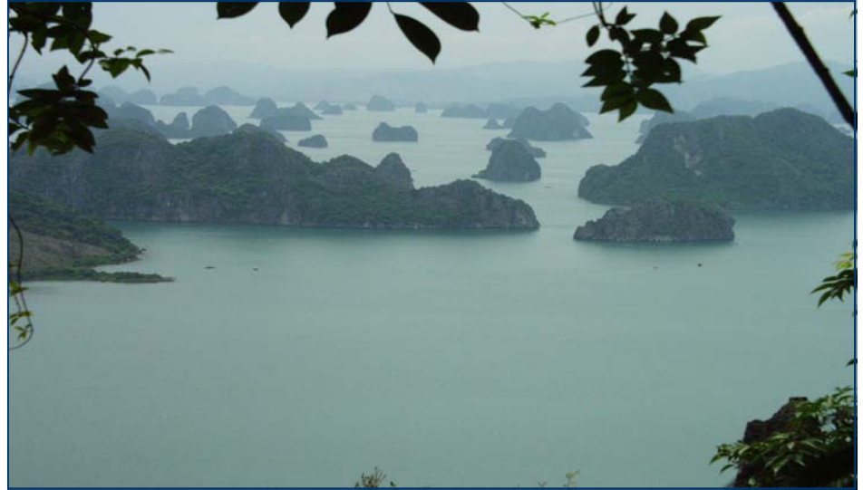
Bai dai beach, Halong commune, Van Don district

Thanks to specific living conditions, the marine animal population of the National Park consists of many precious species like: Haliotis sea worms, pearl oysters, Turtles... especially Dugong or Sirenia which have been recognized as precious animals that need to be protected throughout the world. According to the local community and fishermen here, in October every year, Du