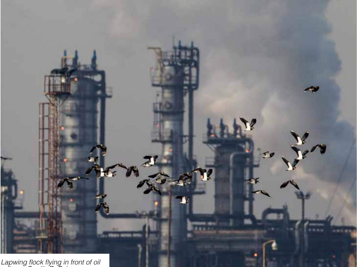
Lapwing flock flying in front of oil refinery

our aims in developing the principles was to encourage closer, collaborative working between all stakeholders involved with biodiversity NNL/NG projects. In particular, focusing on the involvement of ecological and social specialists who often work in silos throughout the lifecycle of a development project. These principles are the product of a huge collaborative effort, with representatives from over 15 organisations generously giving up their time to attend workshops and provide comments on draft versions.