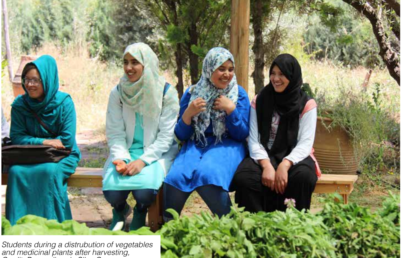
and medicinal plants after harvesting, Credit: Pommelien da Silva Cosme

This garden now includes a plant nursery, green house, ethnobotanical garden, vegetable garden, aromatic and medicinal plant garden and a recreational space for students to study.