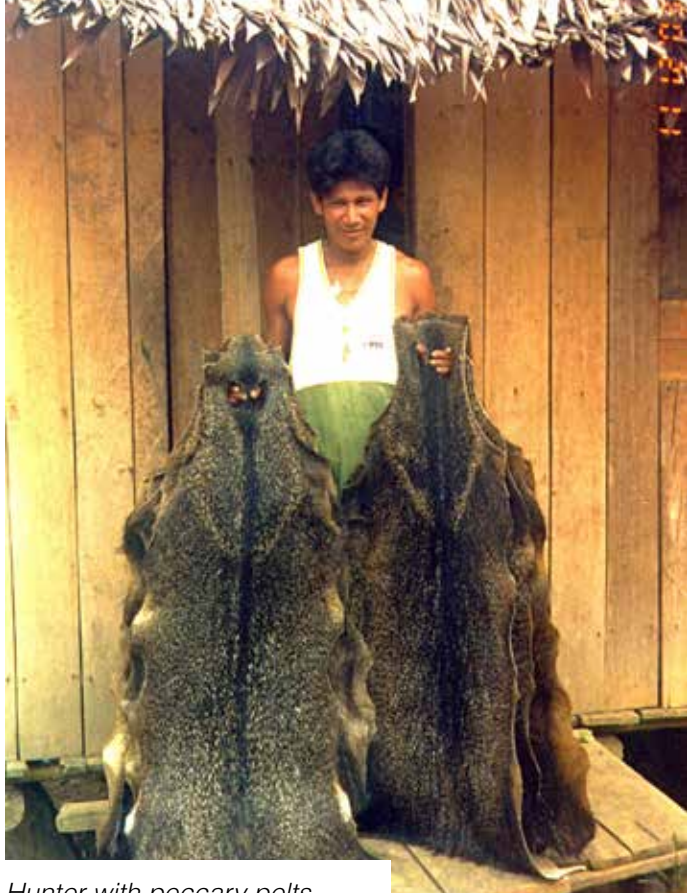
Hunter with peccary pelts, Credit: Pablo Puertas

the past decade have been sold to the European leather market. Certified communities have greatly reduced their hunting of animals such as primates and tapirs and have set limits on hunting of animals appropriate for wild meat hunting such as peccaries, large rodents and deer.