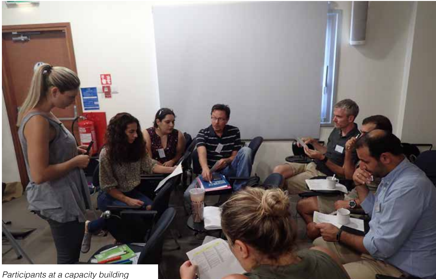
Participants at a capacity building workshop in Cyprus, Credit: Helen Roy

contributed to better understanding around vectors of diseases.