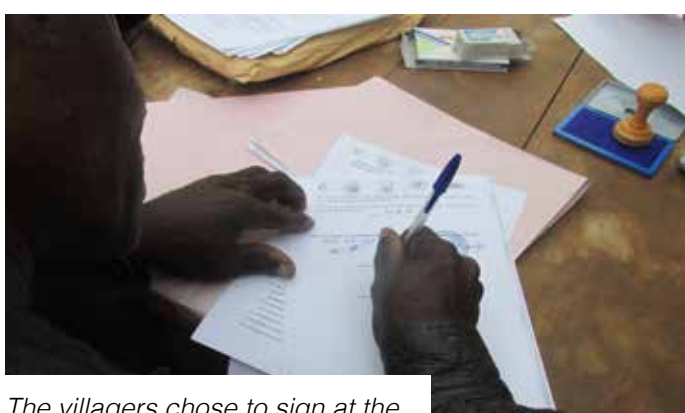
The villagers chose to sign at the individual level rather than as a collective, Credit: FCTV

The situation gets worse if expectations of the benefits are not met. In our experience, engaging with a community that has been a 'partner' in interventions where local communities felt 'let down' or promised more than what was actually delivered, is a far harder task than working with people who have no previous interactions with wellmeaning NGOs.