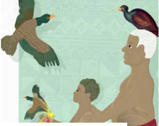
The cover and illustration of "Mose and the Manumea"