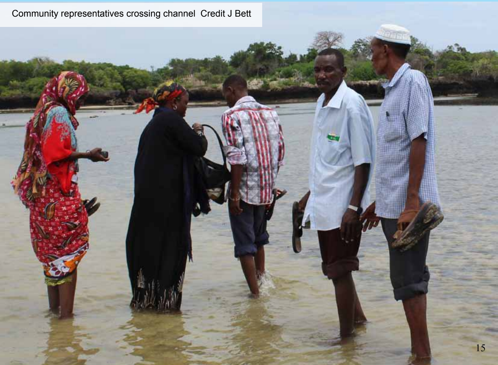
Community representatives crossing channel

improve understanding of community –based and simple and affordable human wildlife conflict mitigation measures as well as livelihoods options. A total of eleven (11) participants (4 women and 7 men) benefited from the exchange tour and were drawn from Darwin Initiative-funded project beneficiaries (local Aweer community and WWF partners - Kenya Forest Service and Kenya Wildlife Service). The tour offered the community representatives an opportunity to learn directly from local community on their experiences on participatory forest management, human wildlife conflicts and diversification of livelihoods. Most of the successful community projects visited consisted of those that were earlier or are currently funded through WWF. The trip also