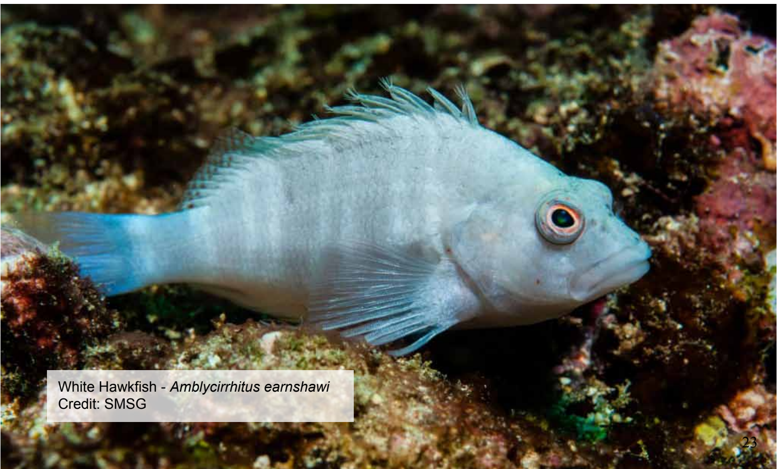
White Hawkfish - Amblycirrhitus earnshawii