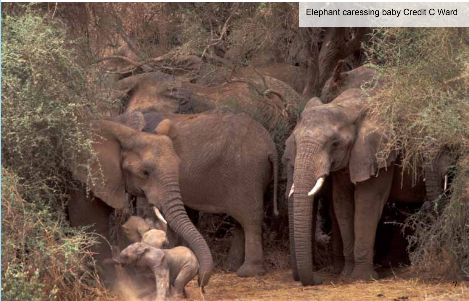
Elephant caressing baby

The results of the study provided the starting point for a three-day workshop organized with the Ministry for Decentralisation and Land