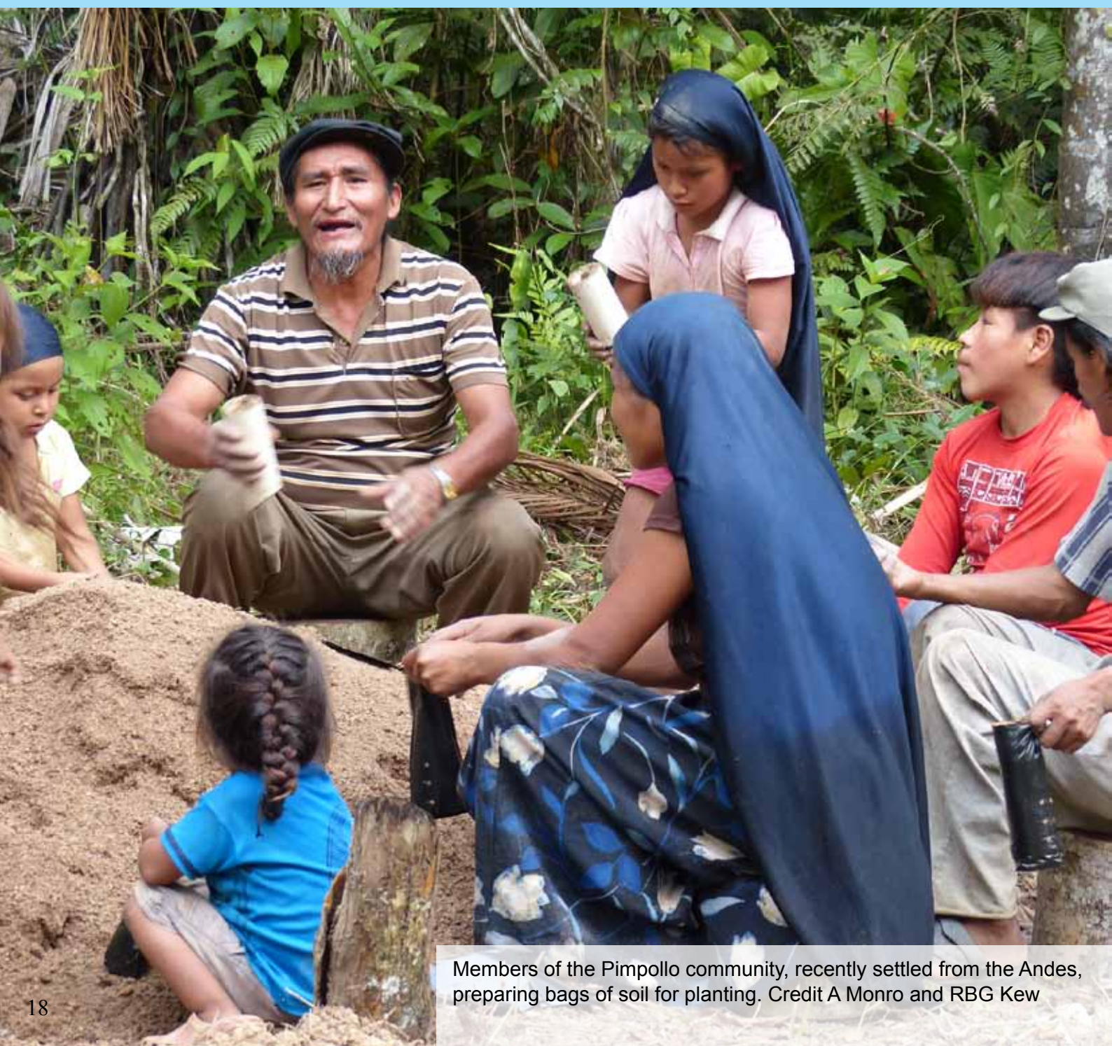
Members of the Pimpollo community, recently settled from the Andes, preparing bags of soil for planting.

The forests of Pando are suffering increasing levels of deforestation. The recent influx of large numbers of poor Andean migrants, allocated significant tracts of land in an environment in which they have no farming experience has exacerbated the situation to the point where urgent solutions are needed.