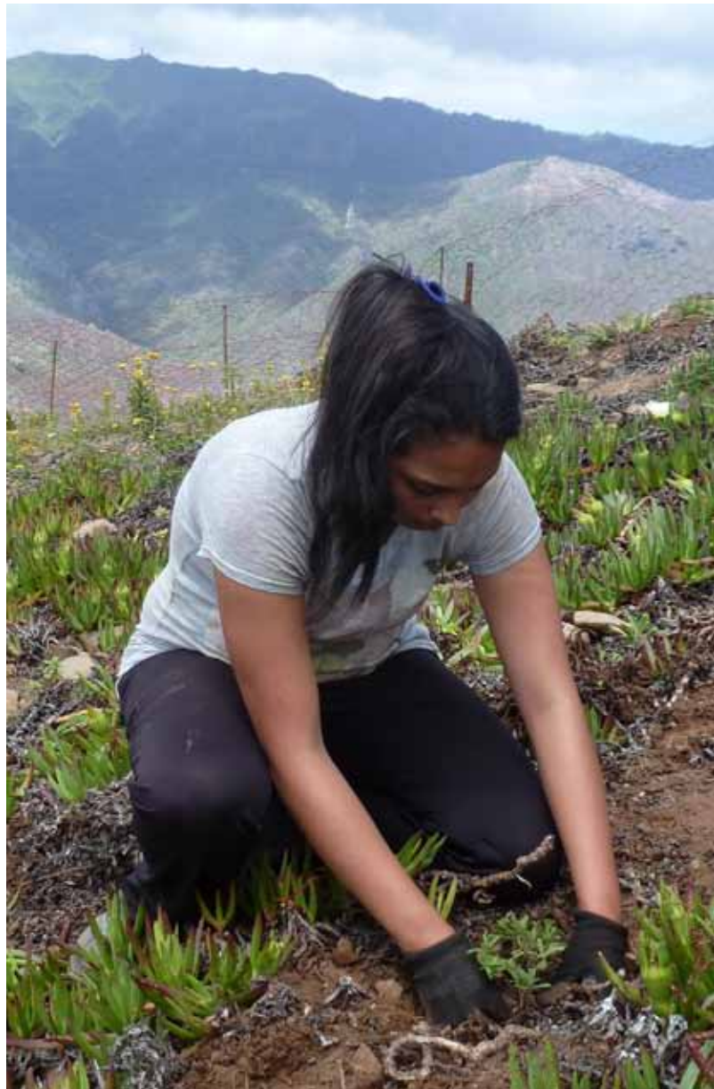
The beginning of restoration work planting back endemics at Blue Point Ridge

For more information contact: pm.comforests@shnt.org.uk