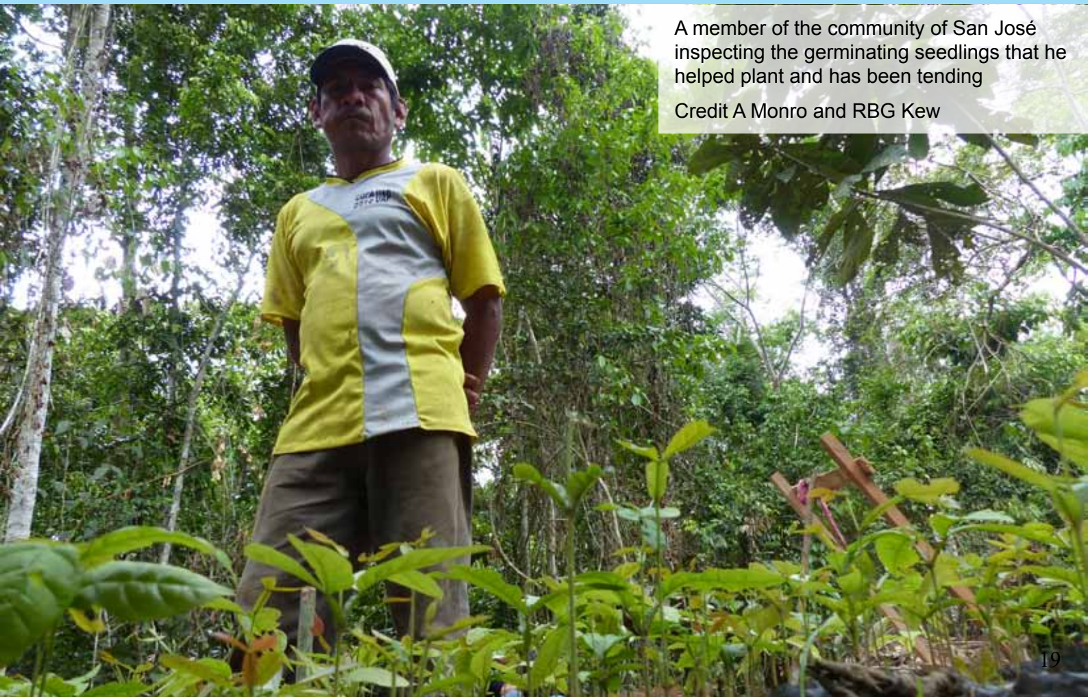
A member of the community of San José inspecting the germinating seedlings that he helped plant and has been tending

For more information about the project go to our blog: http://tropicalbotany.wordpress.com/