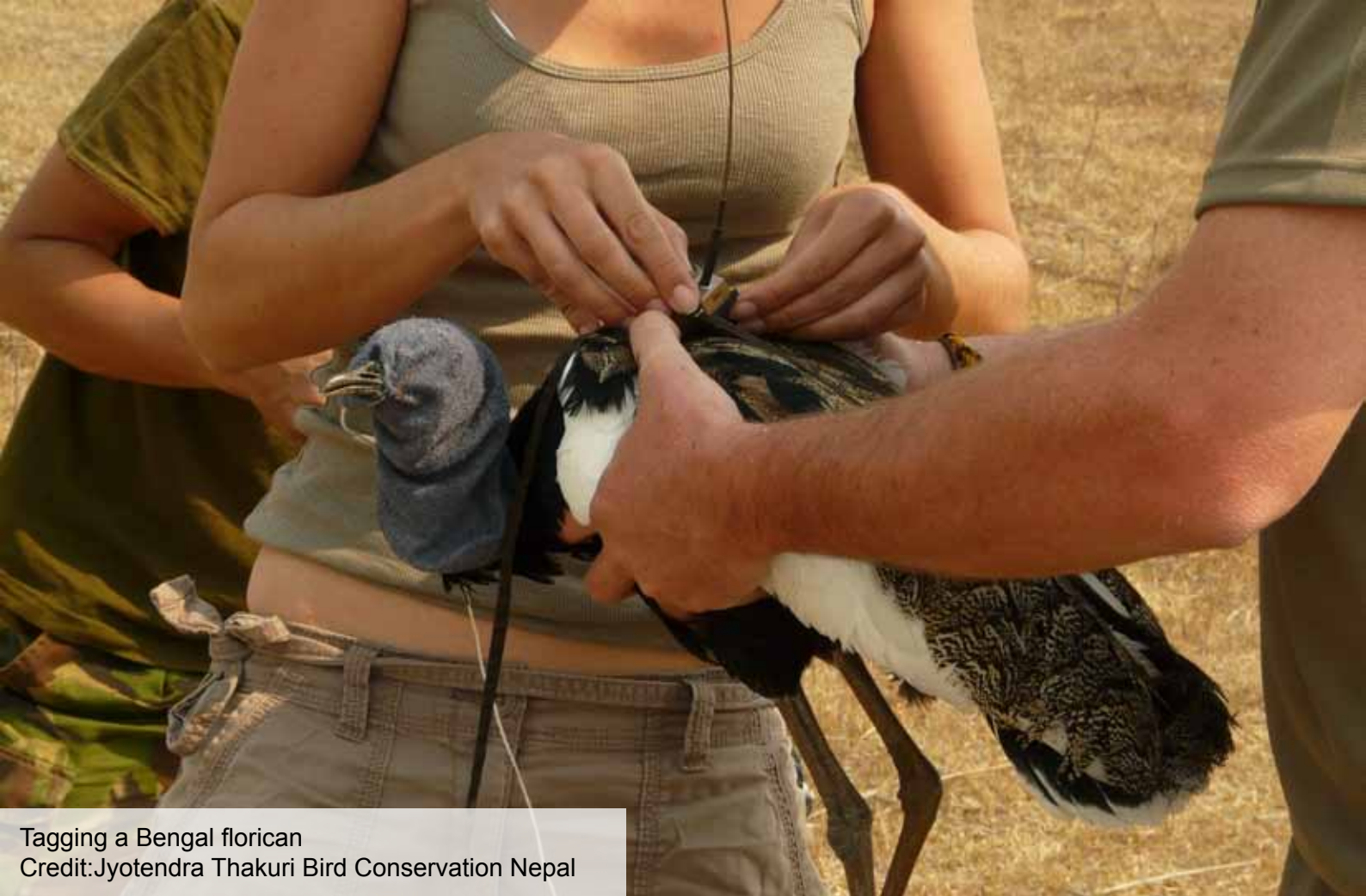
Tagging a Bengal florican

movements of the two tagged birds, and rather surprisingly they have not ventured very far from the areas where they were caught. If it remains the case that they do not move very far, then conservation efforts to protect their habitat might be easier than first thought but begs the question why the birds are not seen outside of the breeding season.