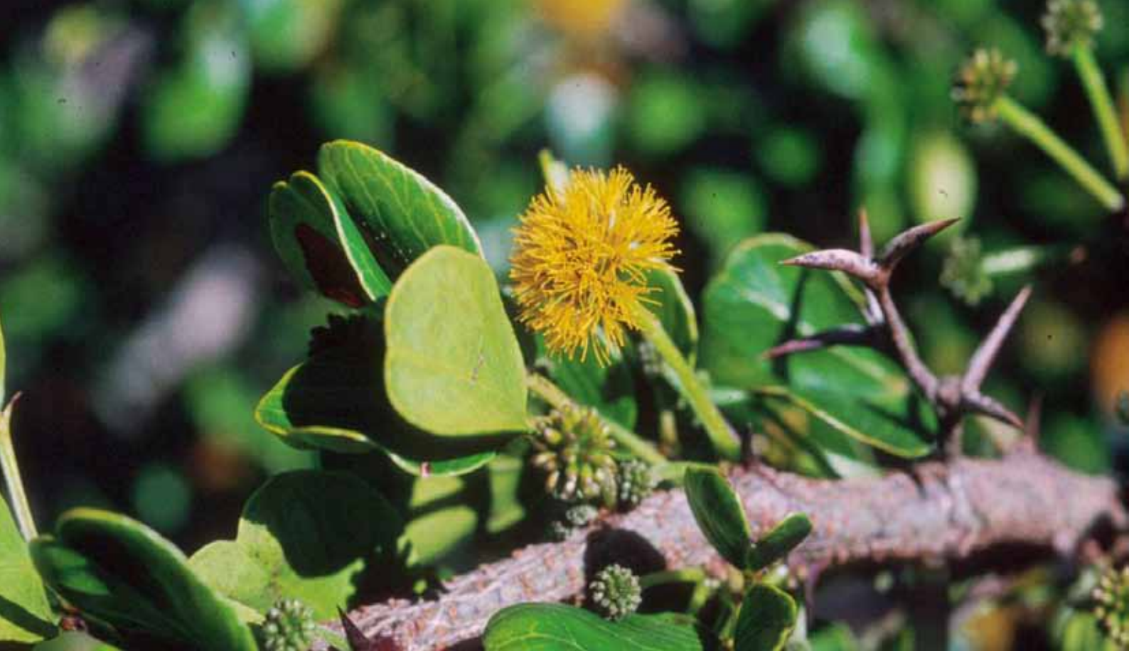
Photo of Acacia anegadensis .