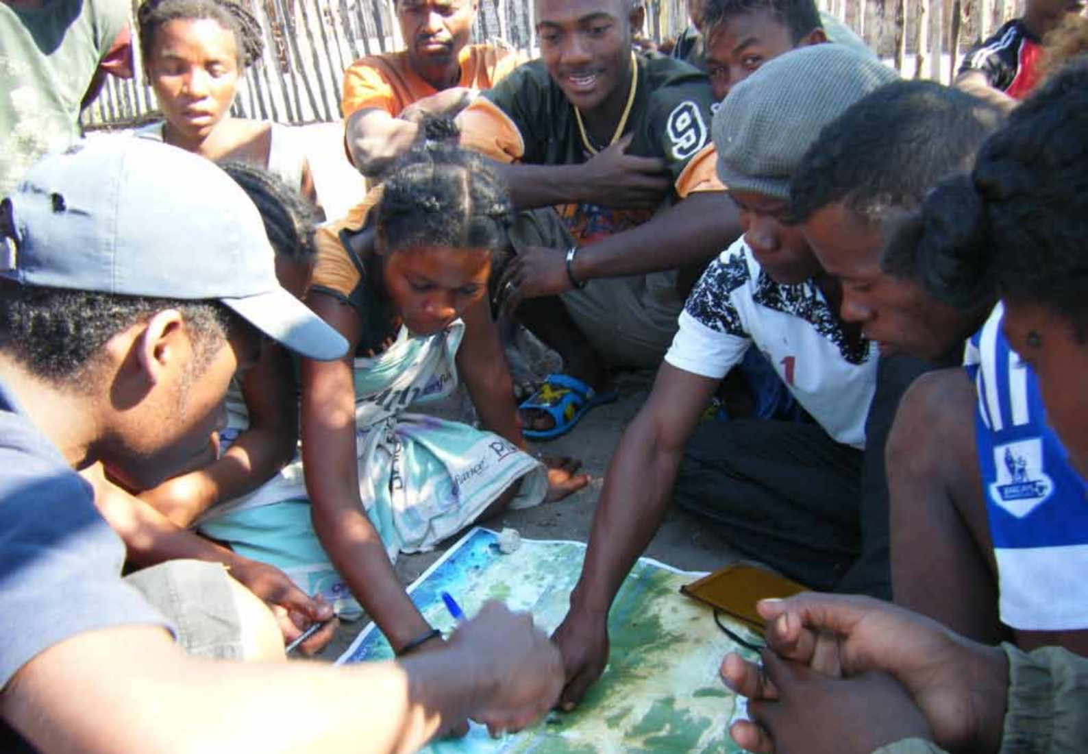
Participatory mapping in the Bay of Assassins